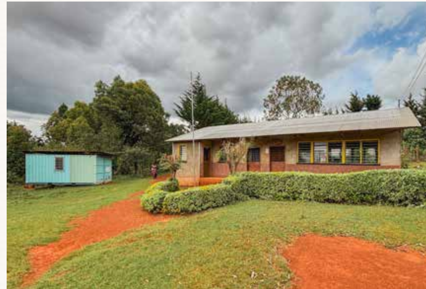
The German School in Ngechek

„Missionary“ - this word makes me think of Hudson Taylor. Or Jim Elliot and many others. These were people who left everything behind, who gave their whole lives to bring the good news to a people group. They travelled by ship to a place far away from their home and their community. No mobile phone, no dictionary. That’s what I imagine „real“ missionaries to be like. Hudson Taylor was in China 150 years ago. Of course, being a missionary has changed since then. My missionary life looks different to Hudson Taylor’s. And ▶