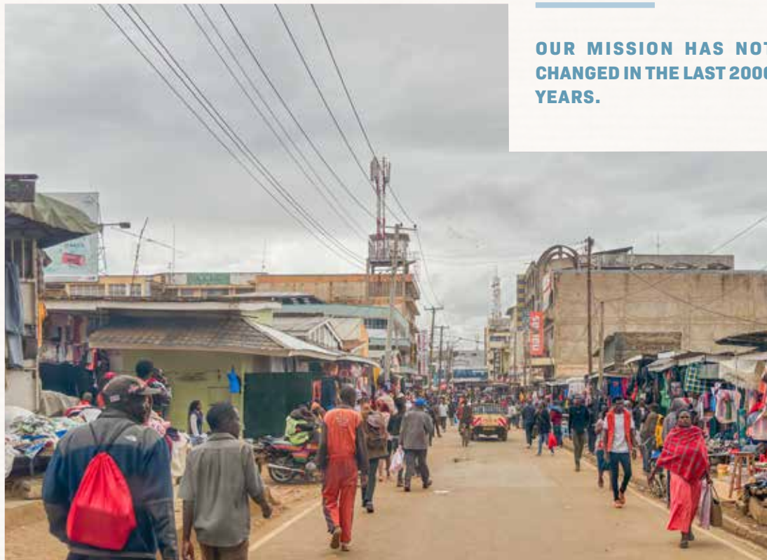
On a shopping spree in Eldoret

vides us with what we need: with sufficient finances or with short-term students to teach our children. Everything comes at the right time. It's a blessing to be able to experience something like this! What we also really appreciate is that my „work“ is just around the corner. This gives us more opportunities to spend time together as a family than we had in Germany. We can eat together, meet up for a tea break - or the kids can just pop into my office from time to time it's a privilege for us to be able to work in a Christian team. It can be challenging at times, but we can still experience that God uses us as an imperfect team with all our sharp and rough edges to build his kingdom, and when you do what God has called you to do, it is a great blessing. It also makes us happy to be here! Even though shopping takes a whole day. Even though we miss the lovely people in Germany. Although it is sometimes difficult to make yourself understood because you can't talk to the other person in your own native language, our life as missionaries differs from the life of Hudson Taylor in more ways than one. Compared to him, I don't feel like a missionary at all. But even though I sit at a desk most of the time and am not an evangelist and could not tell as many amazing stories as Hudson Taylor, our mission has not changed in the last 2000 years. Hudson