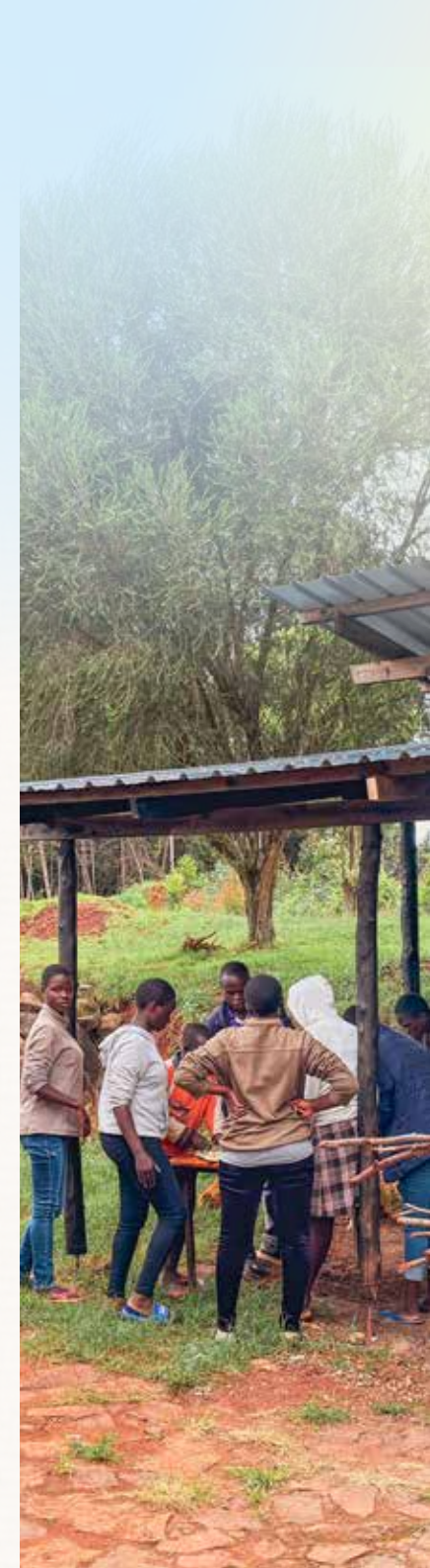
Our children's home children hear a lot about Jesus during their time with us