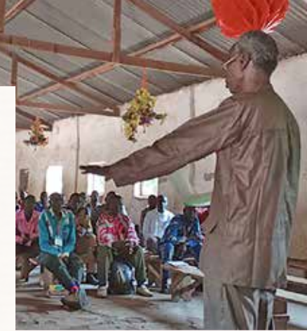
Our „Mobile Bible School“