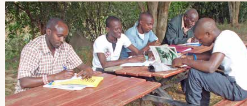
Study time of the students

And this mission is still valid today. Calling people to follow Jesus is also the goal of DIGUNA and runs like a thread through the various areas of ministry. The following pages will give you an insight into how Jesus’ mission „to make disciples“ is being lived out in different ways in South-East Africa today. I hope you enjoy reading them.