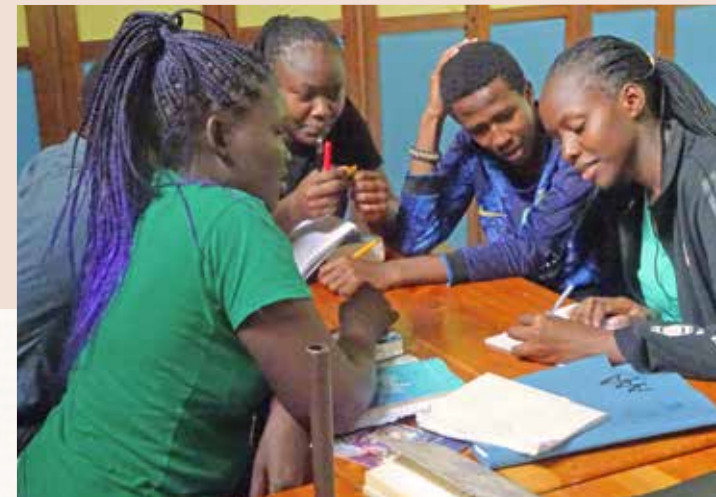
The pupils discuss what they have heard.

WE WANT TO SHOW THE PARTICIPANTS WHAT THE BIBLE TEACHES, BUT ALSO HOW WE CAN APPLY THIS IN OUR LIVES AND HELP OTHERS TO DO THE SAME.