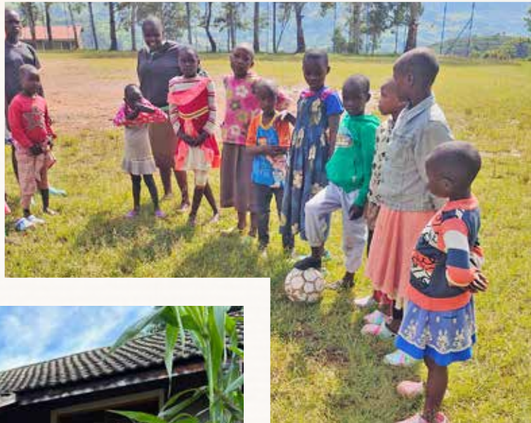
At the age of 4 to 8 years children are admitted to the homes.

The children are nurtured and disciplined wholly to maturity by foster parents who are their role models, as they