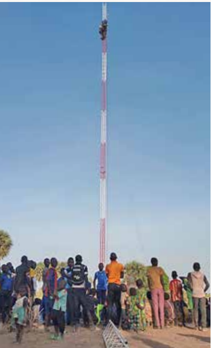
Left: Setting up a radio station Down: Our trumpet section

for the last few years in Chad and are excited to see what God has in store for us in the coming years. Because 80 out of 141 peoples in Chad are still unreached.