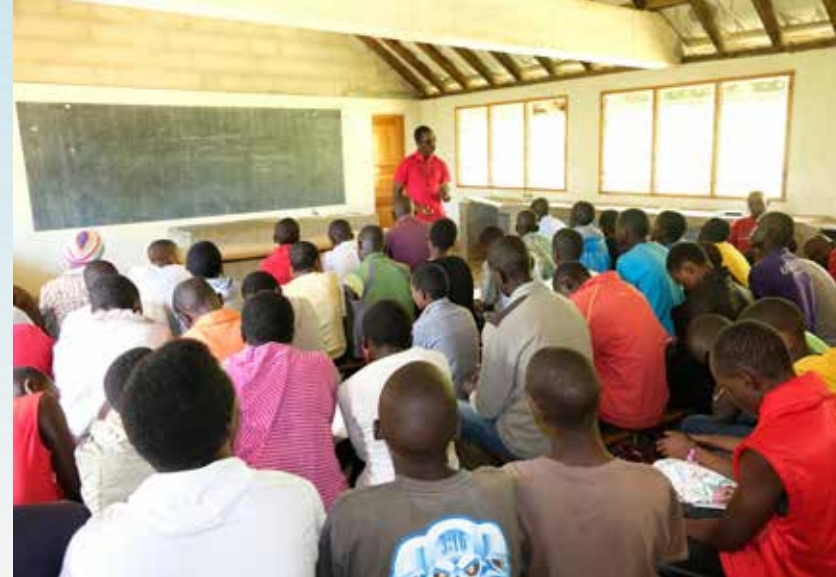
During a teaching unit

WE SINCERELY THANK GOD FOR MAKING IT POSSIBLE FOR US TO REACH THESE CHILDREN.