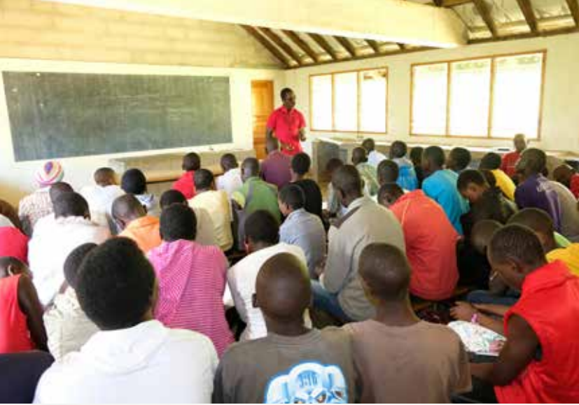
During a teaching unit

are growing and developing. They are admitted into the homes between 4yrs to 8yrs and are nurtured and disciplined through daily life upbringing to maturity until they are ready and able to depend on themselves.