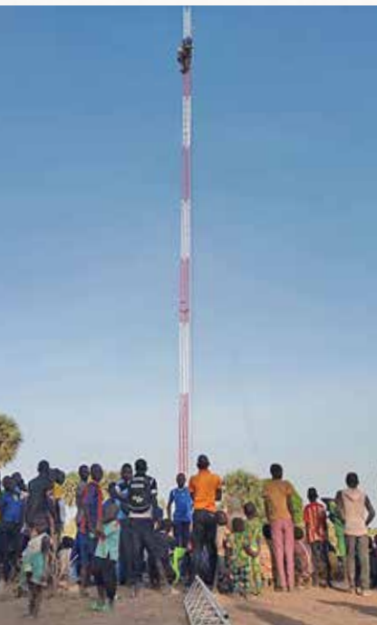
Left: Setting up a radio station

In recent years, we have been less involved in evangelism due to a lack of staff and capacity. We are delighted to see that all the churches in the country are very motivated to organise crusades themselves without our help. The churches can still get tracts or Bibles from us for their events, but they do the rest all by themselves. To strengthen the churches, we started the so-called „Mobile Bible School“ in 2017. This short-term Bible school programme is a great help for the church members. It enables them to learn much more about God, his nature and his actions. We have already run this training programme in six different