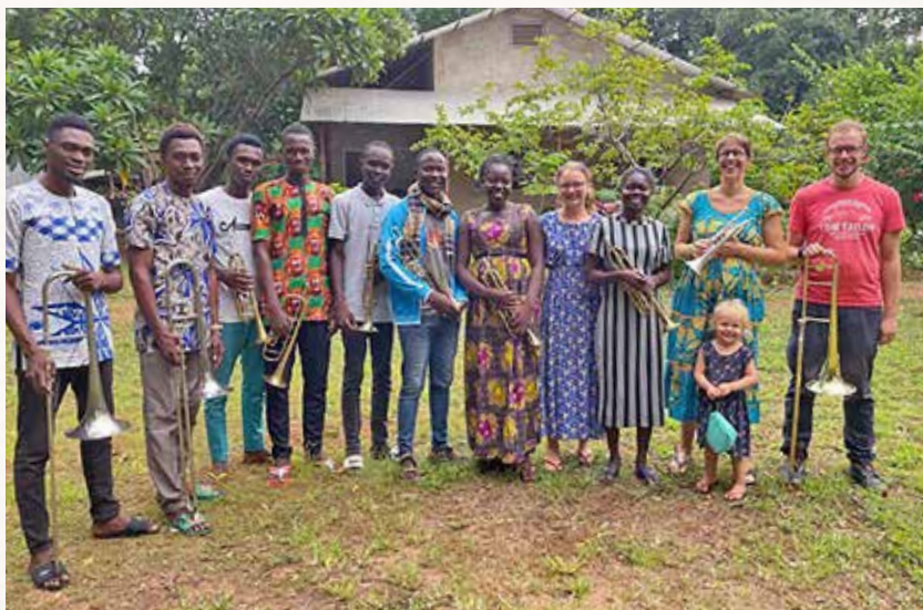
Down: Our trumpet section