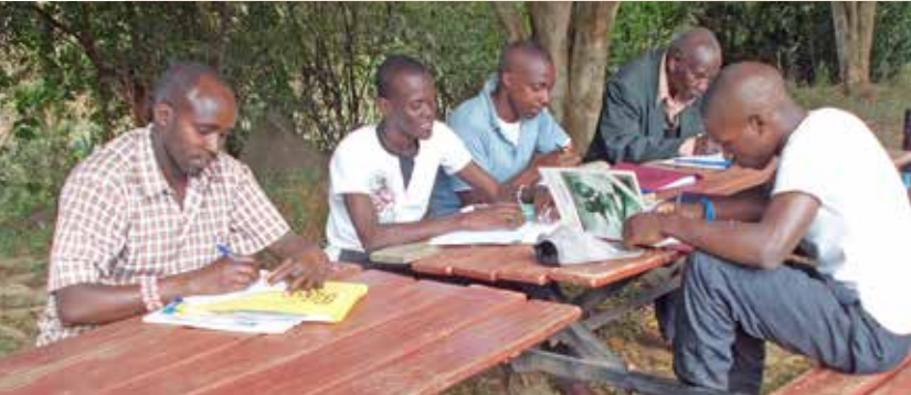
Study time of the students

I consider it a privilege to live in Kenya, a country where about 35% of the population describe themselves as „saved Christians“. I don't think any other country in the world has a higher percentage of