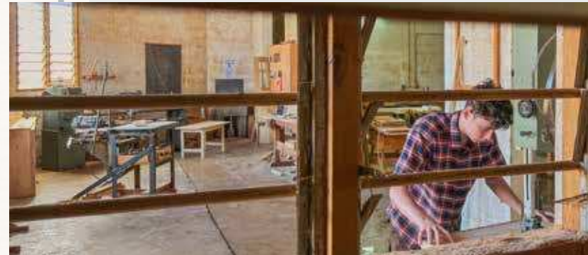
Short-term employees in the workshop

Whenever a new short-term employee comes through our entrance gate of the mission station, I feel an exciting tingle. It reminds me of the day I myself arrived in Tindret as a short-term employee