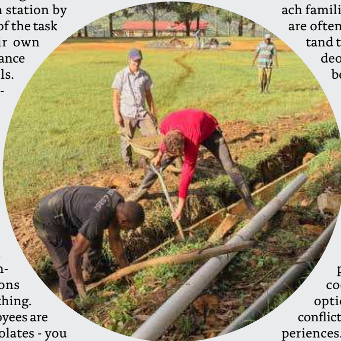
Top: Short-term employees who provide practical help with construction projects on the ward Down: A learning assistant teaching the German missionary children

like to stay longer, despite the challenges they face here: living in shared rooms, unfamiliar food, unfamiliar approaches, different priorities, etc. Not only the different languages, but also cultural differences make communication difficult. If the short-terms are then only able to reach familiar supporters, who are often unable to understand the situation, via video call at best, it may be necessary to open up to new people they can trust on site. Although we do not have a structured mentoring programme, each station tries in its own way to be there for the short-term employees and offers coordinated contact options for questions, conflicts and borderline experiences. Many short-term employees report how Jesus stood by them in these challenges and made them strong, but spiritual growth is only one aspect of why such an