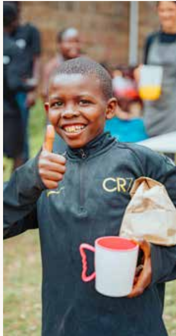
Above: Showing love by distributing food

WE BREAK THE ICE WITH A FEW GAMES AND THEN SHARE THE GOSPEL, EDUCATION AND LIFE SKILLS WITH THEM.