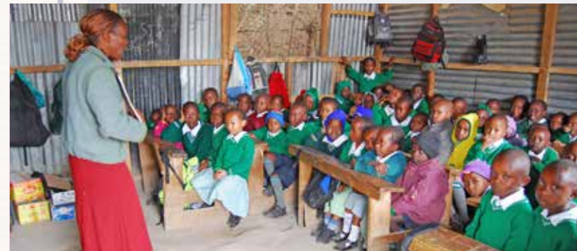
Every week we can talk about Jesus in schools.

Diguna known through spreading the Good News, is earnestly involved in various initiatives directed towards giving hope to children and youth. We play a significant role in shaping the lives of