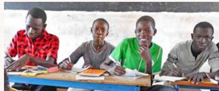
We invest in the spiritual well-being of young people as well as in their physical well-being.

ble. He takes some of them on evangelistic outreaches where they can discover their talents and make a contribution to the Lord's work. This motivates young people, and mentoring takes time and commitment. But it is worth it and we are happy to see change in some young people - even if it often takes a long time.