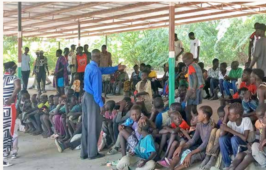
Many street children from Lodwar take part in the Christmas party.