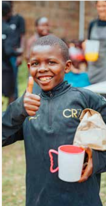
Above: Showing love by distributing food

WE BREAK THE ICE WITH A FEW GAMES AND THEN SHARE THE GOSPEL, EDUCATION AND LIFE SKILLS WITH THEM.