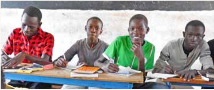
We invest in the spiritual well-being of young people as well as in their physical well-being.