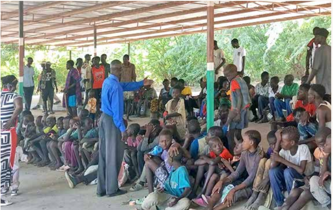
Many street children from Lodwar take part in the Christmas party.