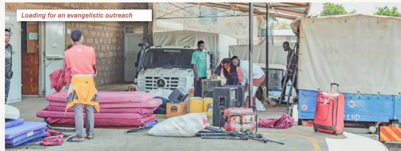
Loading for an evangelistic outreach