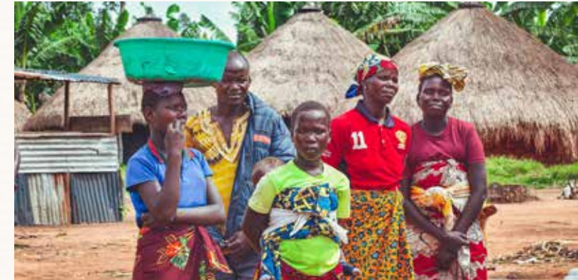
Reaching people in Africa with the gospel – despite all the changes, this remains DIGUNA's main concern.