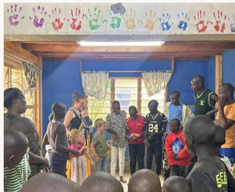
Major changes are also in store for the children's home.