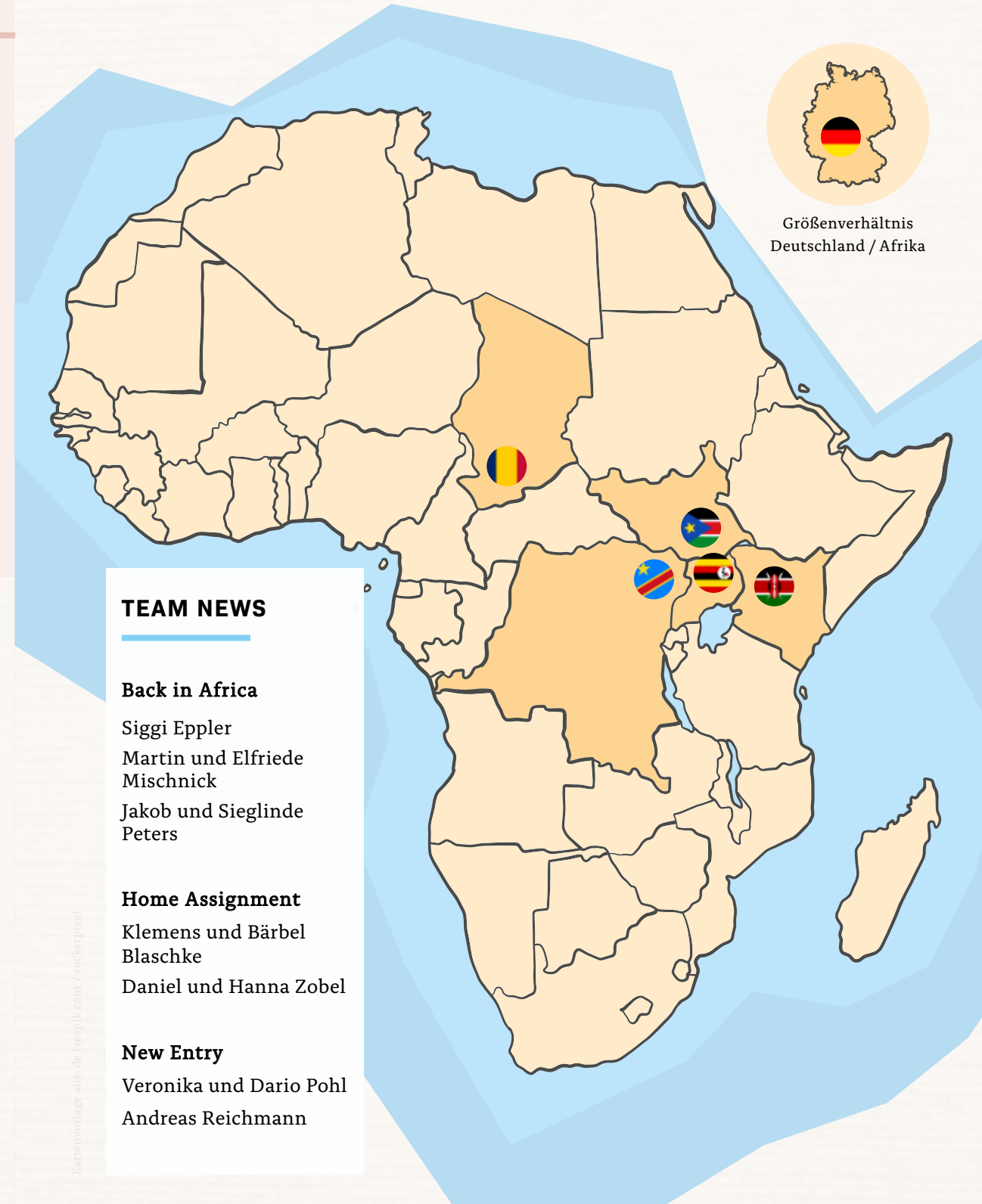
Größenverhältnis Deutschland / Afrika