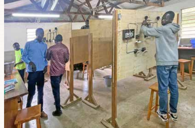
Every year, approximately 150 young people complete their two- or three-year training in seven skilled trades.

Our employees are and remain the most important resource for our evangelistic and practical work in the workshops. We are grateful that God continues to provide