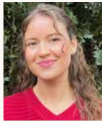
Jessica Lange Mbagathi / Kenya