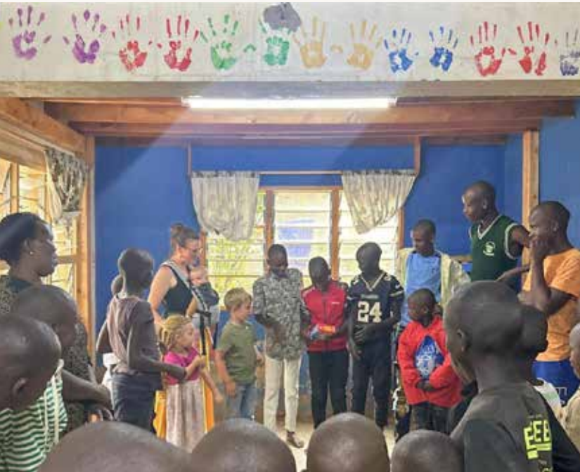
Major changes are also in store for the children's home.