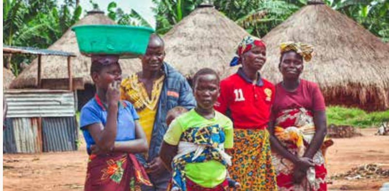
Reaching people in Africa with the gospel – despite all the changes, this remains DIGUNA's main concern.