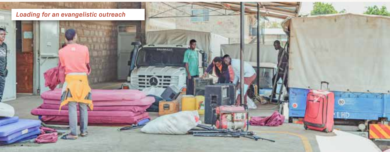
Loading for an evangelistic outreach