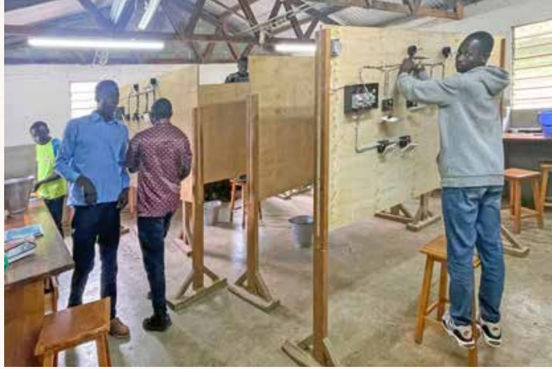
Every year, approximately 150 young people complete their two- or three-year training in seven skilled trades.

Our employees are and remain the most important resource for our evangelistic and practical work in the workshops. We are grateful that God continues to provide